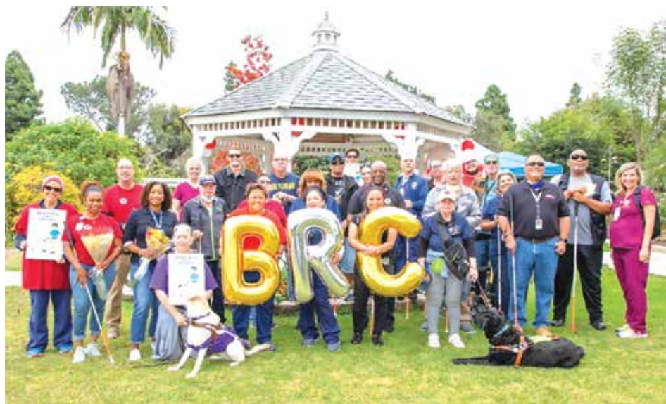
LONG BEACH REPUBLICAN Women Federated Members with blind and visually challenged veterans at the Blind Rehabilitation Center in Long Beach.