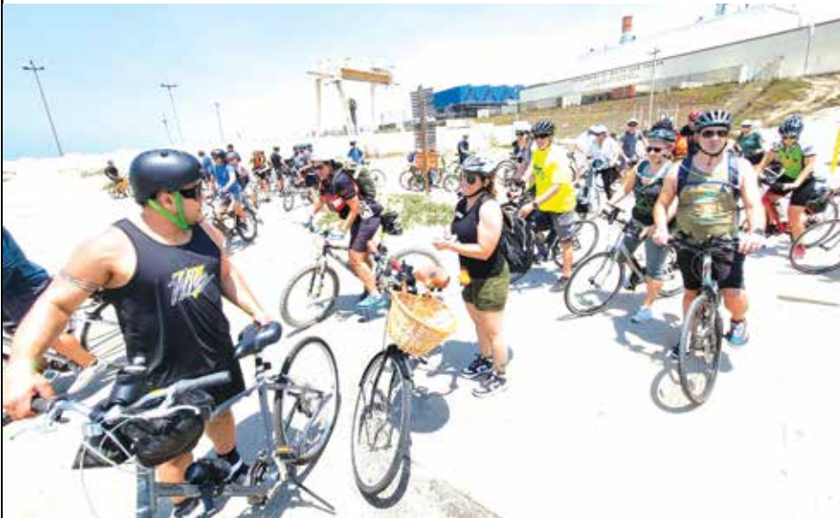
ATTENDEES at a bike fest in Los Angeles, the LACBC is a fundraiser to help transform greater Los Angeles into a safe, healthy, and equitable biking region.

The Los Angeles County Bicycle Coalition (LACBC) invites area residents to attend its inaugural 2022 LA Bike Fest - the ultimate bike party and LA's Pedal-Powered Fundraising Celebration taking place on Saturday, November 5, 2022 from noon – 4p.m.