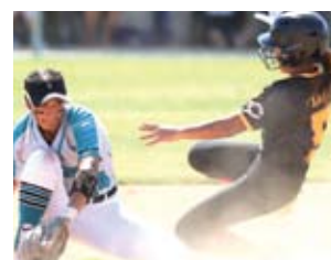
Cerritos HS Out of Playoffs Softball team gets runners on but can't cash in. Page 6.