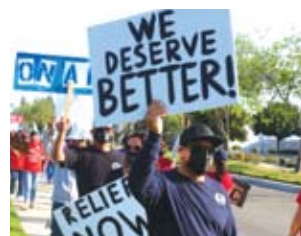
Picketing for Pay ABCUSD workers demand pandemic pay. Page 5.