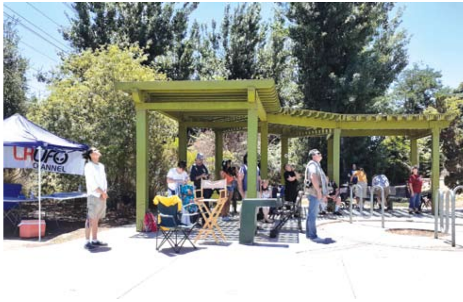
PHONE HOME: Many attendees showed up at Hollydale Park in South Gate to watch the skies for ET's.