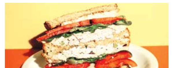
The Next Big Thing - Faux Fish Learn all about plant-based and cell-cultured fish. Page 8.