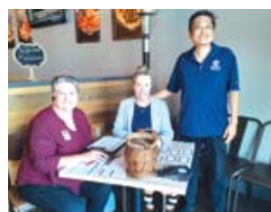
Back in Action Cerritos Regional Chamber holds in-person event Page 5.